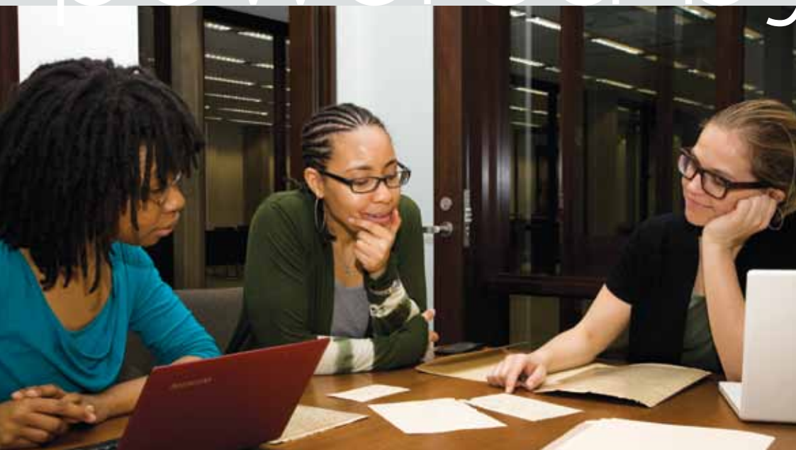
Students examine rare materials in the Special Collections group study now named for John Blew.