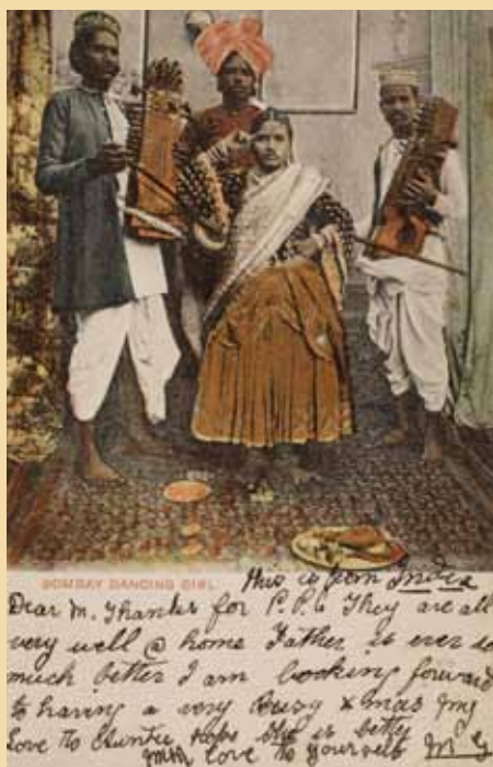
Postcard titled “Bombay Dancing Girl.” The Graham Shaw postcard collection is forthcoming on that site late in 2013.

Three events exemplify the Neubauer Collegium’s collaboration with the Library.